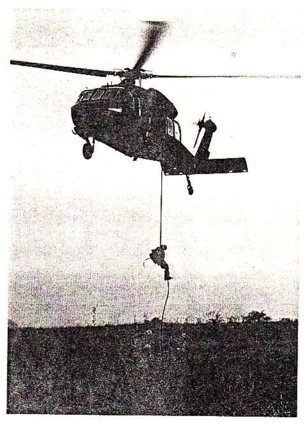
Combat controllers "fast rope" into an insertion point and head for their objective.

"Our fitness program is based on variety, balance,